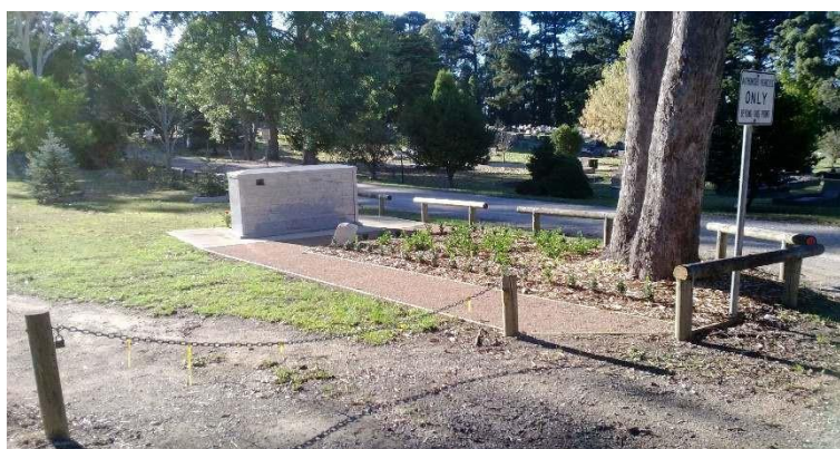
Granite Memorial Wall