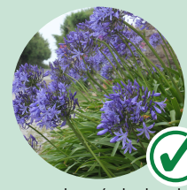
Agapanthus (whole plant)