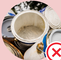
Paints, oils, chemicals or pesticides