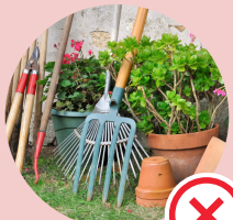
Garden equipment, pots, tools, or edging