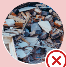
Building and construction waste