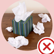
Paper towels, tissues, or dishcloths