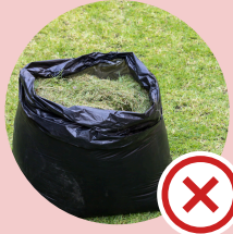
Plastic bags or soft plastics