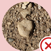
Rocks, soil, or sawdust