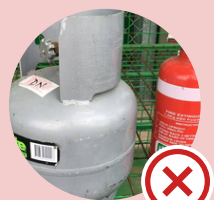
Gas bottles, or flammable waste