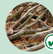
Branches (1.5 cm maximum diameter and 1m in length)