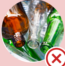
Recycled items (bottles, cans, jars)