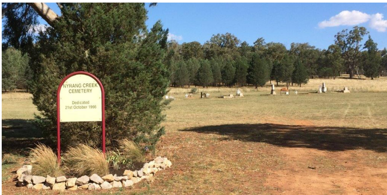
Photograph: Nyrang Creek Cemetery © Cemeteries and Crematoria NSW

Published by Cemeteries & Crematoria NSW