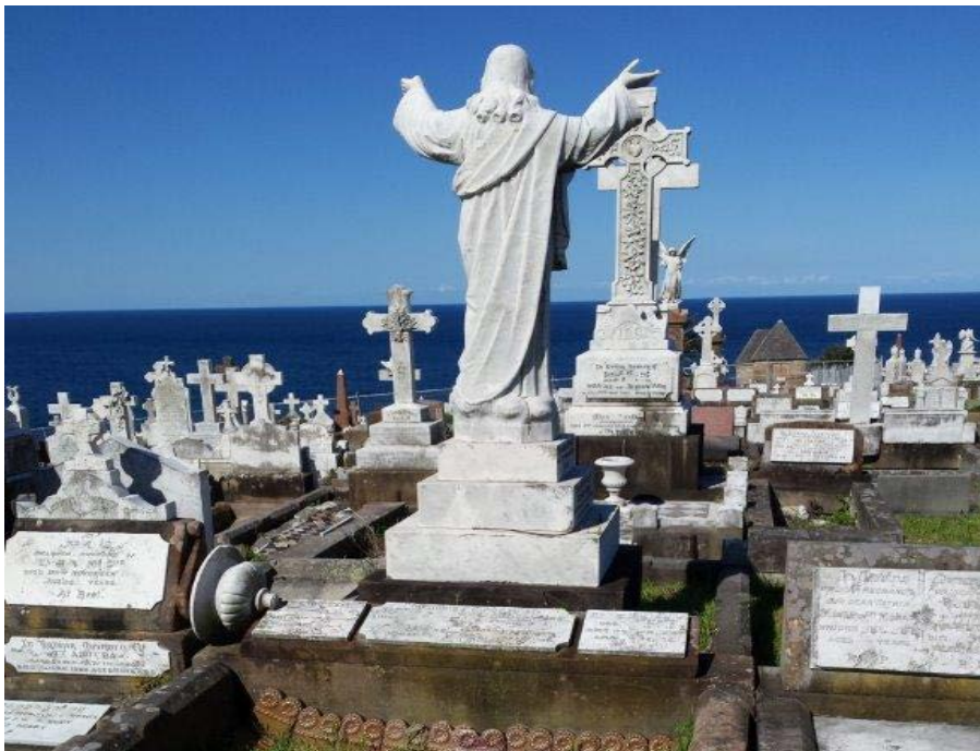
Photograph: Waverley Cemetery, Sydney