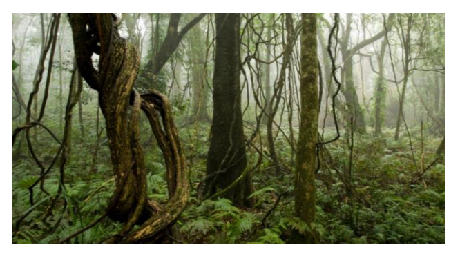
Robertson Rainforest is one of seven protected Endangered Ecological Communities in the Wingecarribee Shire.

Since commencing in 2004, the Vegetation Conservation Program has invested over $360,000 in on-ground conservation works, in addition to private investment. The program has resulted in the conservation of state and federally-listed Endangered Ecological Communities and protected these remnants from damage and degradation caused by livestock, weeds, and feral animals.