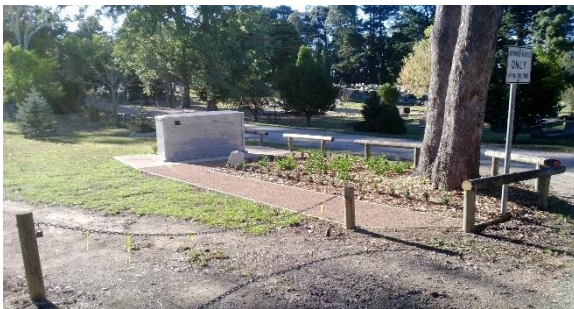
Granite Memorial Wall - Bowral