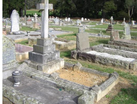
Monumental Area – Bowral