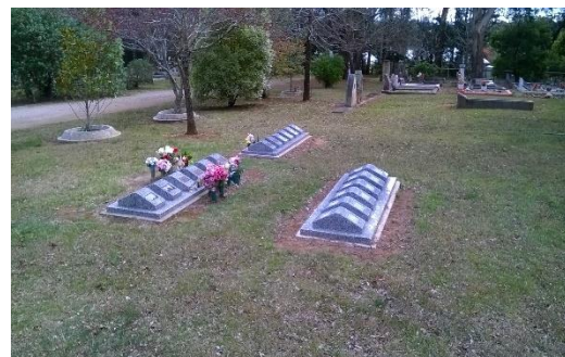
Ash Beams – Bundanoon