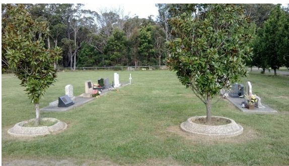
Welby – Memorial Trees & Lawn Beams