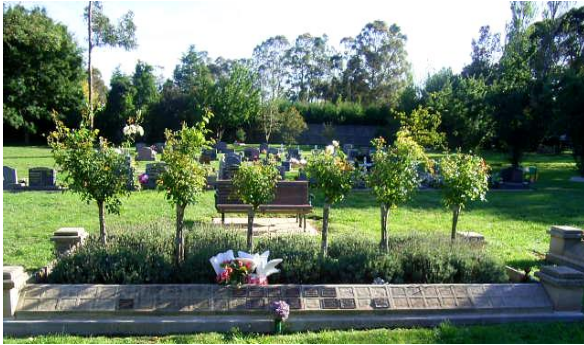
Rose Gardens - Bowral