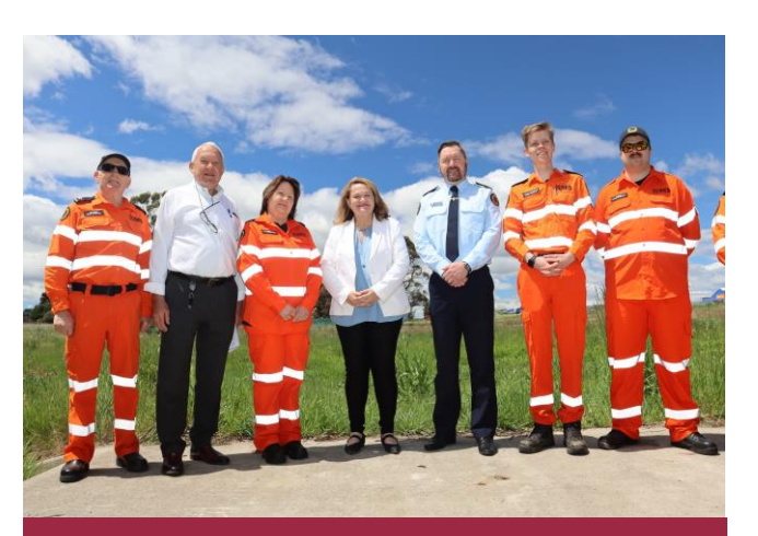
Moss Vale State Emergency Facility Grant - $1,500,000