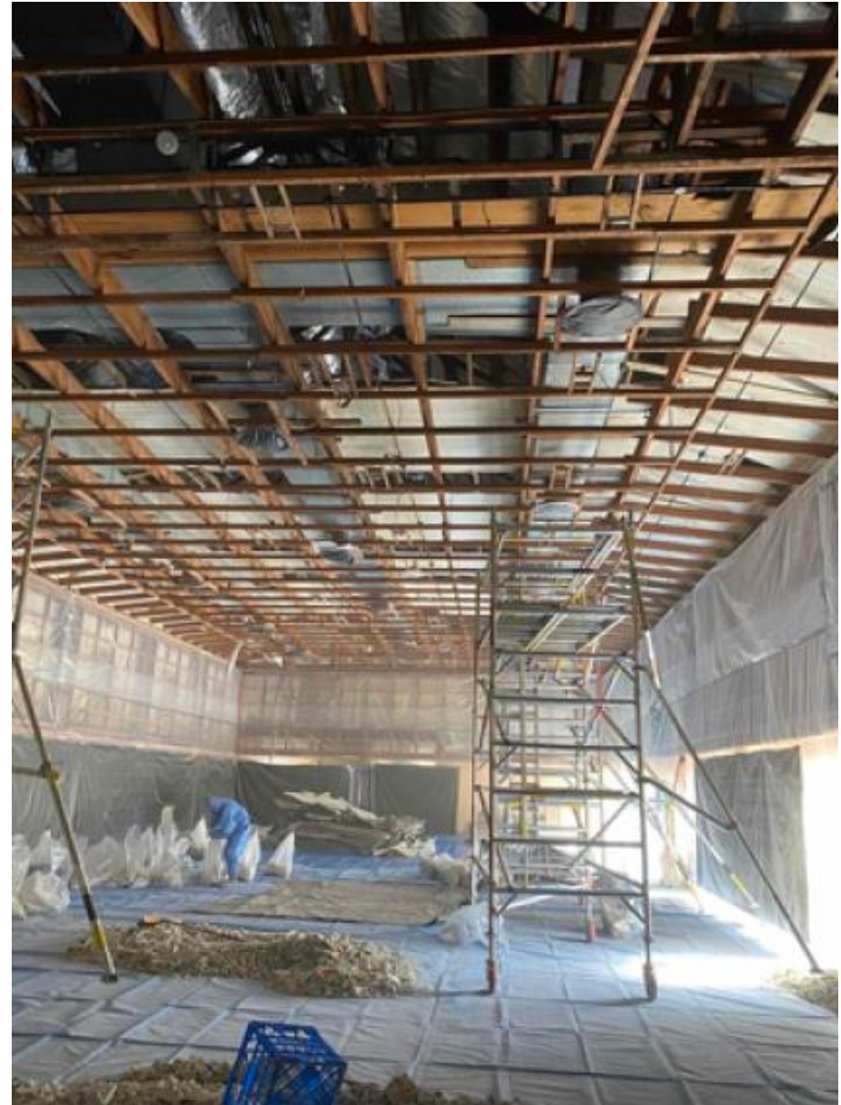
Building encapsulated and contamination removal