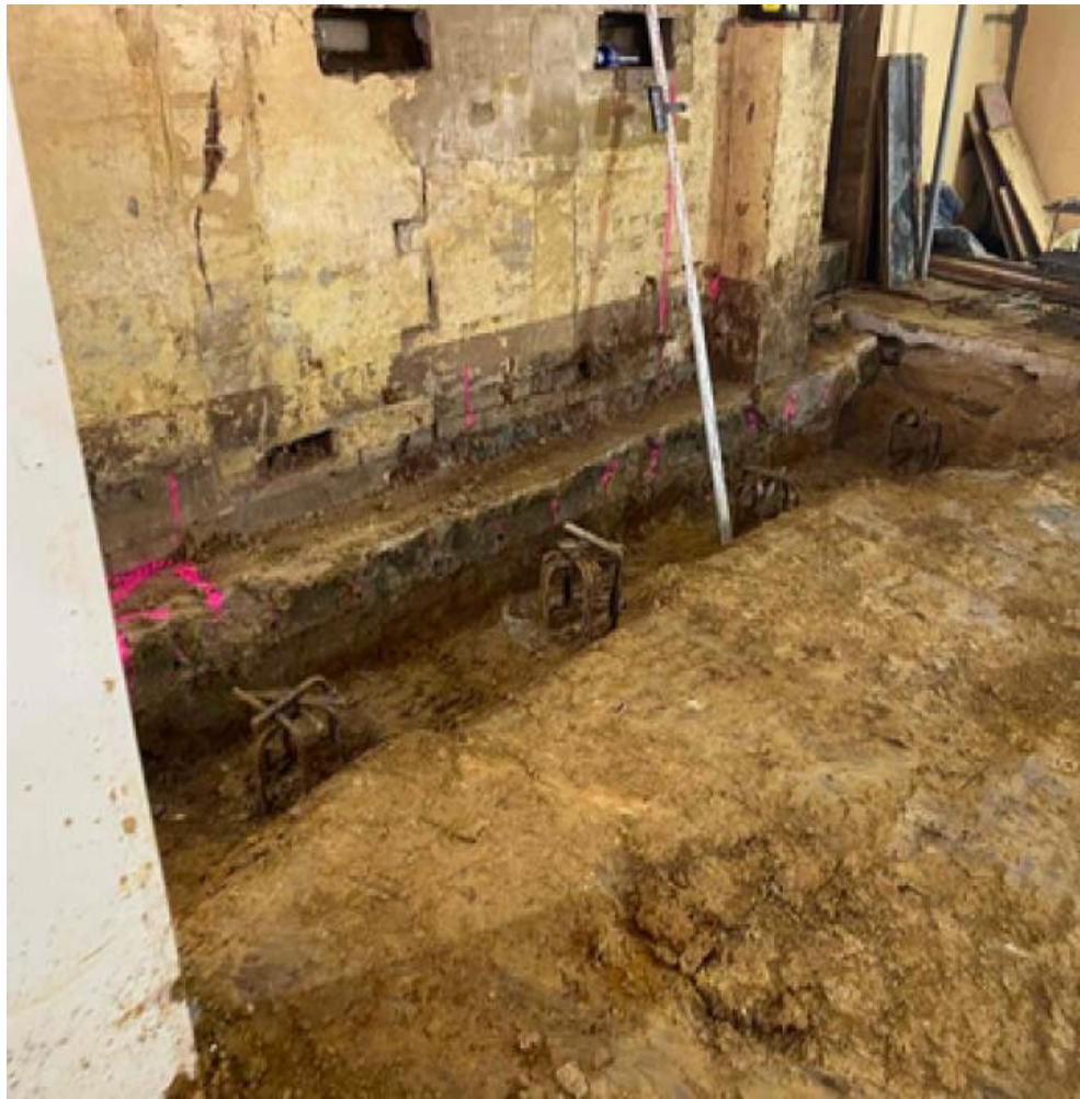
Additional piling and shoring for orchestral pit