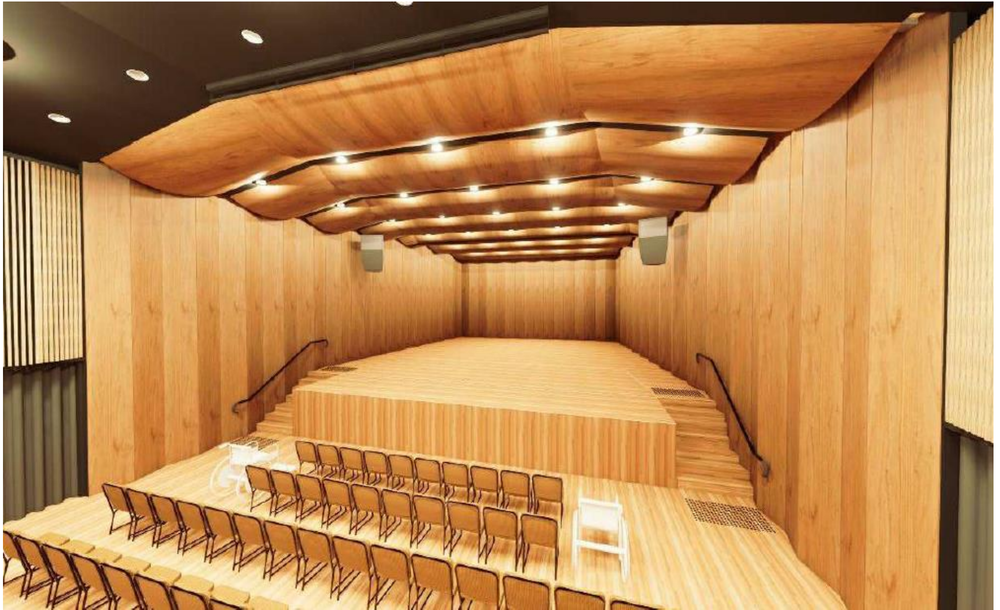
Revised stage design