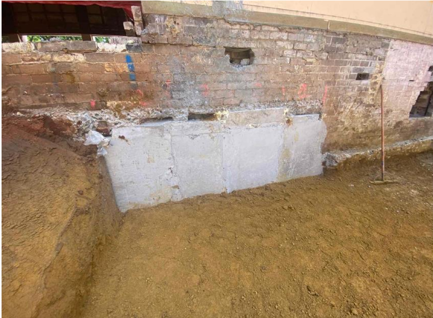
Underpinning to Southern wall