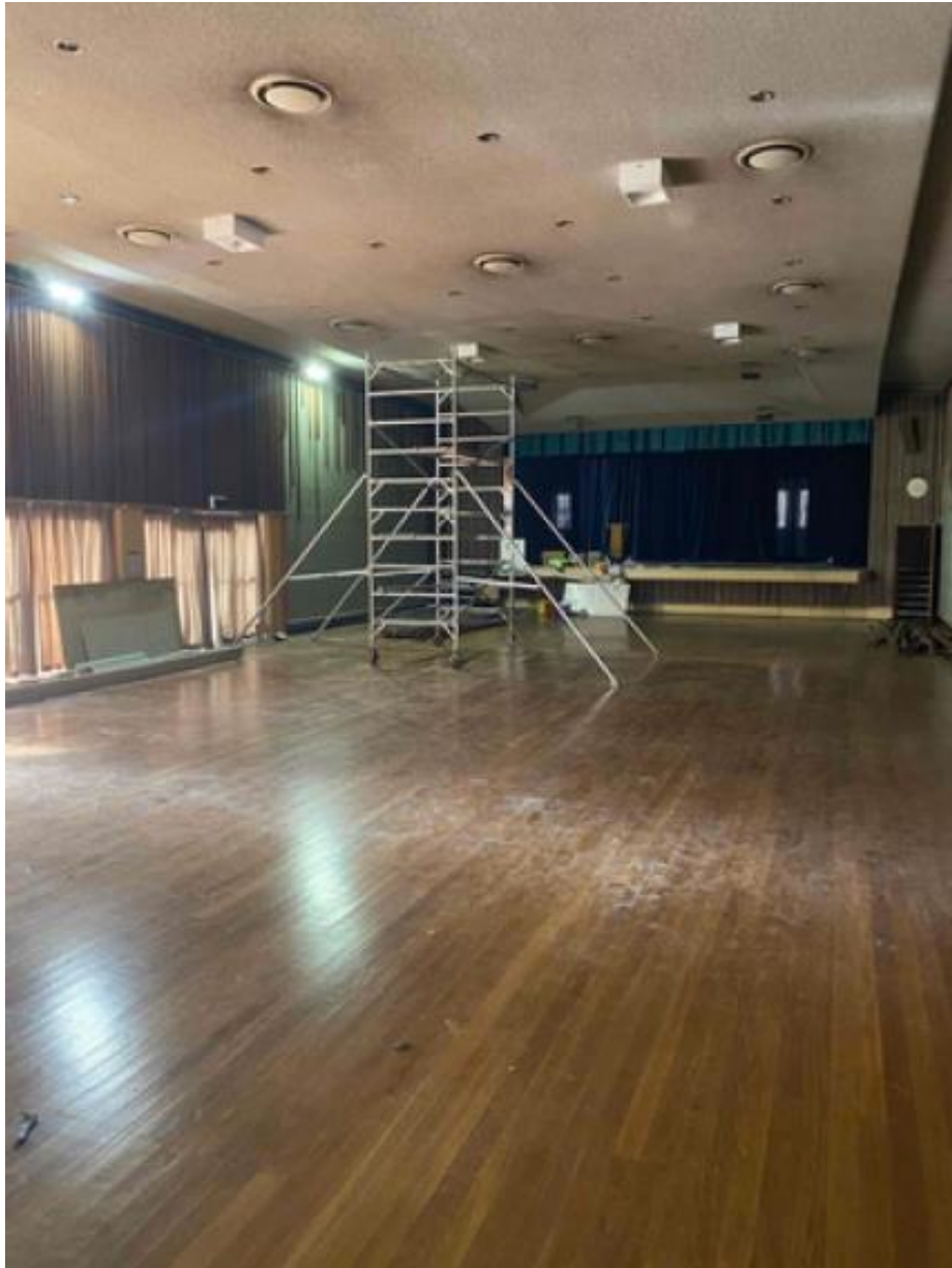
Prior to demolition