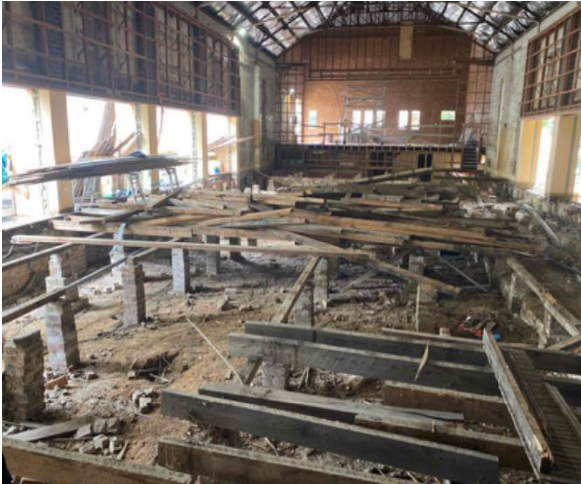
Auditorium hall footing and floor