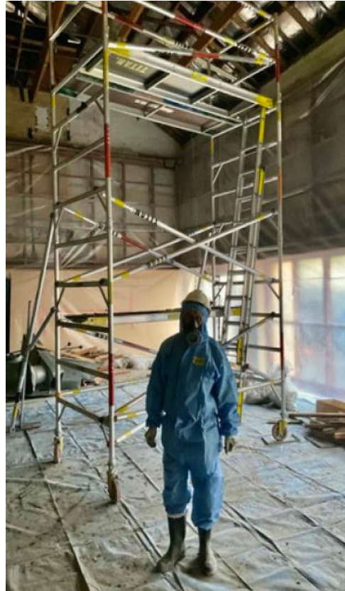
Level of PPE required