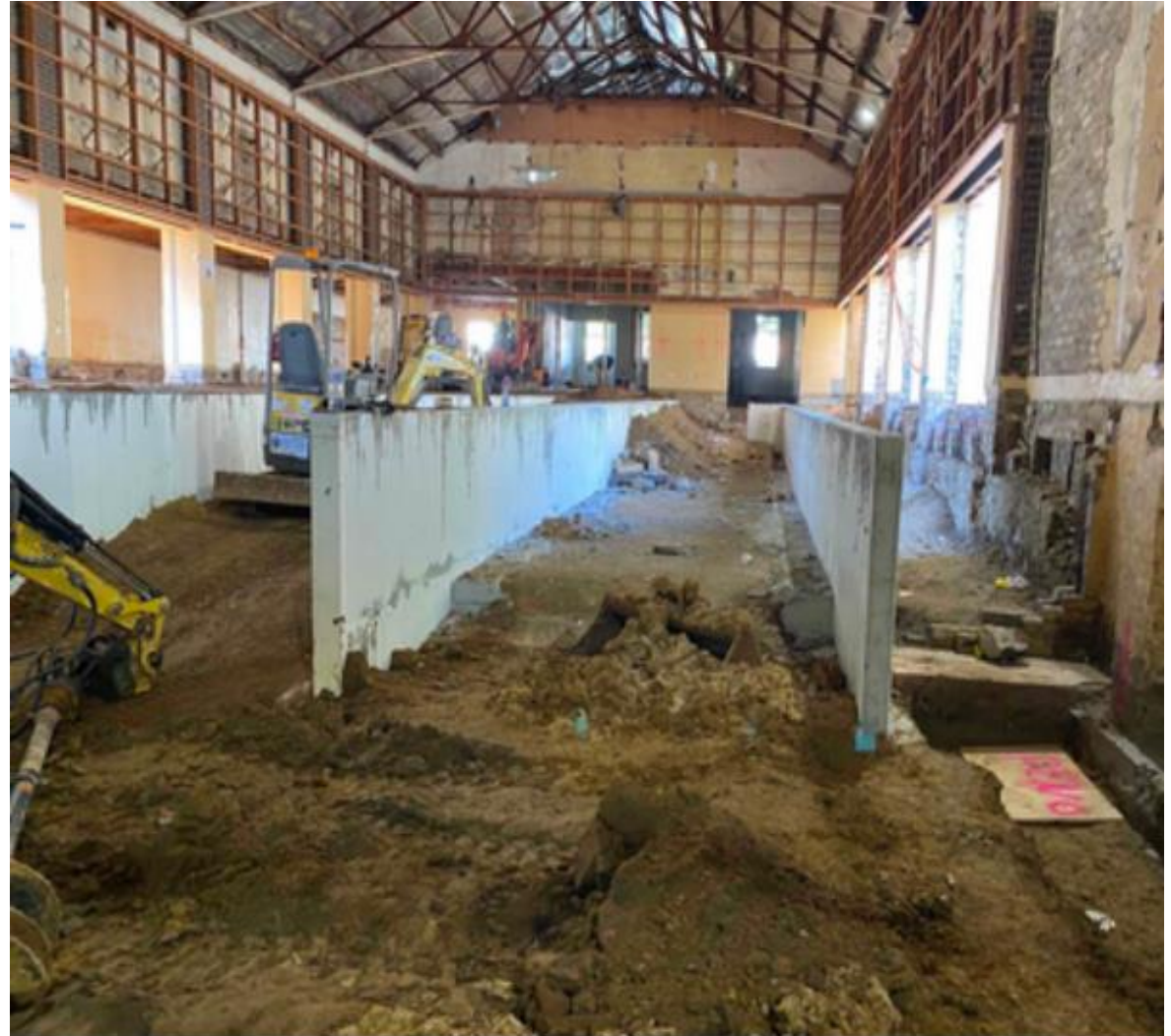
New footing system