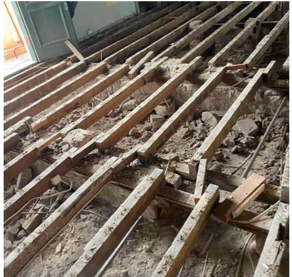
Failing footings in foyer floor