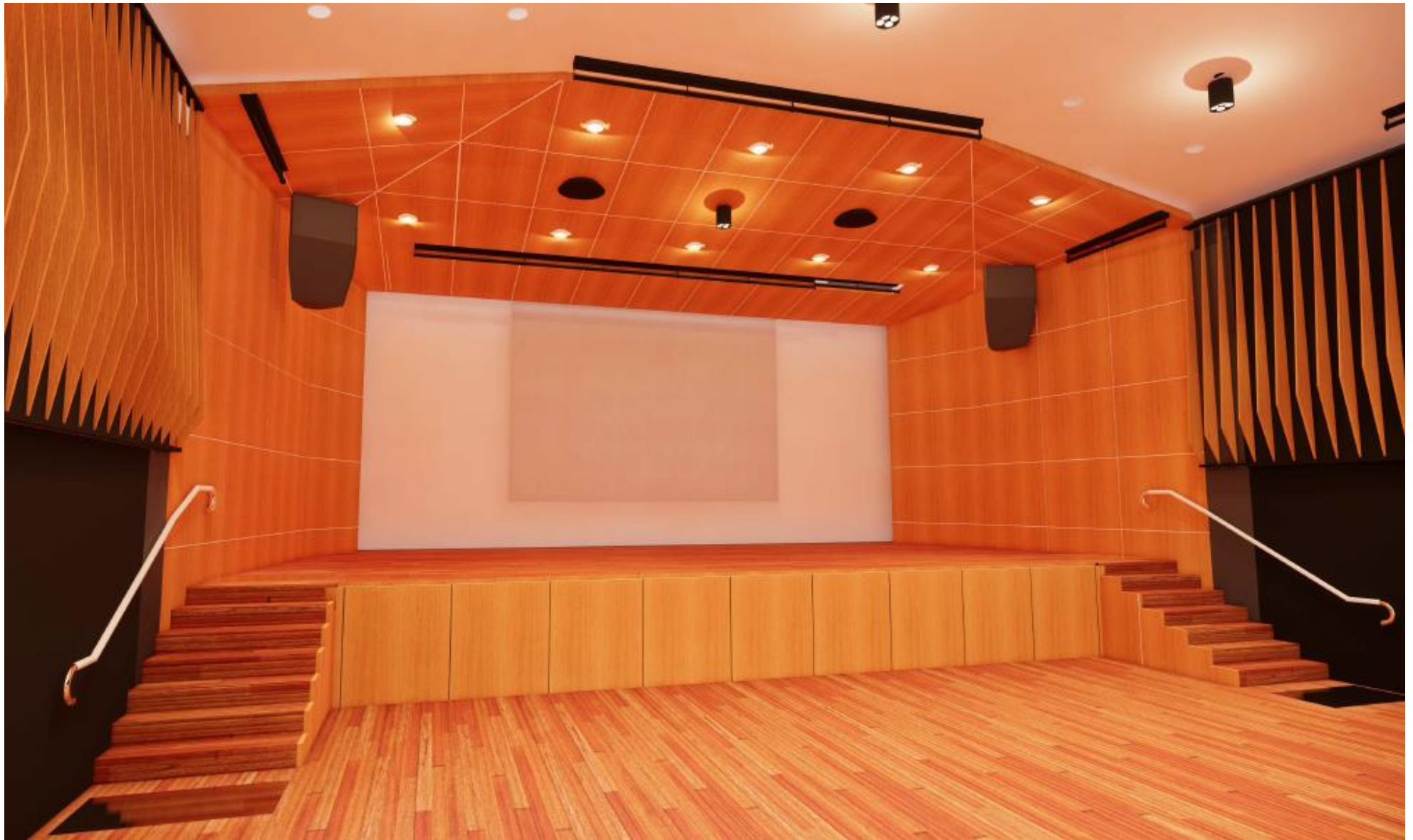
Original stage design