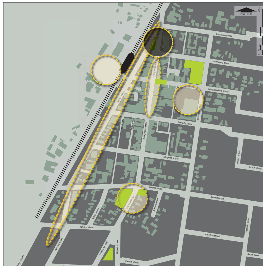
Figure 2.1.20 - Project opportunity Northern Gateway key Plan