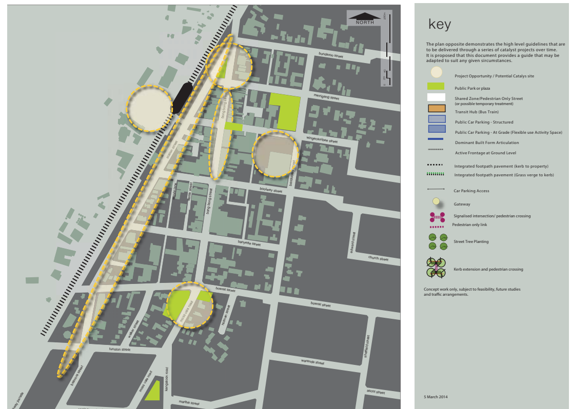
Figure 2.1.19 - Bowral Town Centre Master Plan showing Project Opportunities as discrete projects.

Catalyst developments will set a benchmark for future developments in the centre, particularly in terms of design character, sustainability and civic space