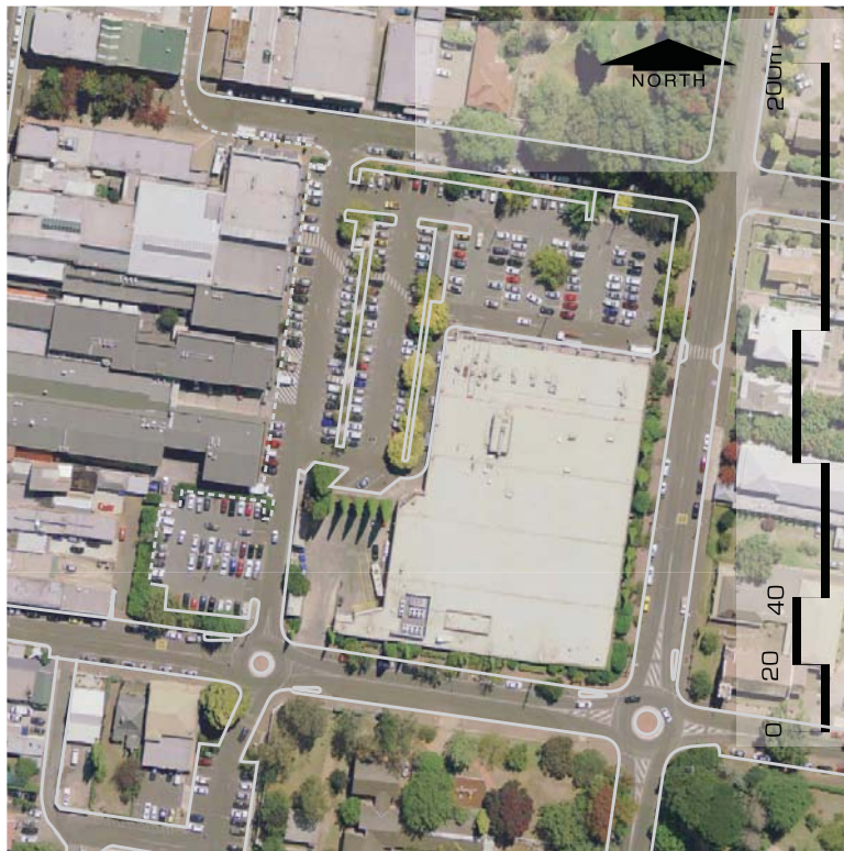
Figure 2.1.24 - Existing plan of the Oxley Mall environs